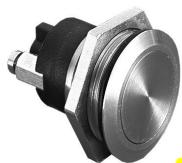
MP0037 Sealed to IP68