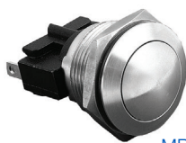
MP0031 Sealed to IP66